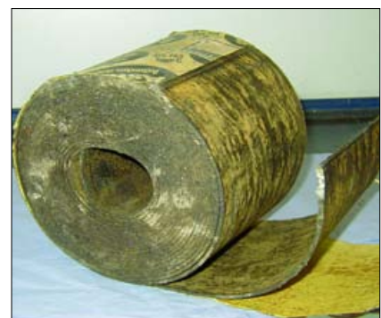
Floor tiles that contain asbestos can also have asbestos-paper backing, or be fixed with asbestos-containing mastic